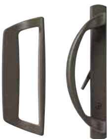
Exterior and interior hardware.

Also available in matching transom and sidelites.