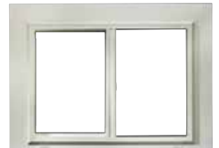
Integral Stucco 2-3/4"